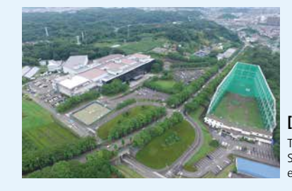
[Midoriyama Studio] The huge 264,500 m<sup>2</sup> Midoriyama Studio using 100% renewabl

Under the J-Credit system for renewable electricity, the government certifies as credits the amount of greenhouse gas emissions reductions from renewable energy. Under this initiative, we have managed to achieve zero-carbon, 100% renewable energy by using J-Credits generated using solar photovoltaic generation installed on houses.